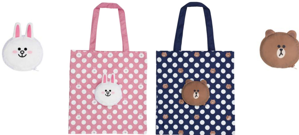
Foldable Tote Bag (Cony & Brown) $23