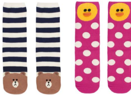
Socks – Girls $16 (2 pairs/pack)