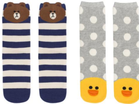
Socks – Ladies $13 (2 pairs/pack)